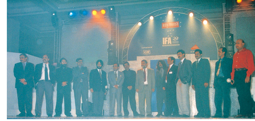
Winners all! IFA 2001 awardees gather on stage