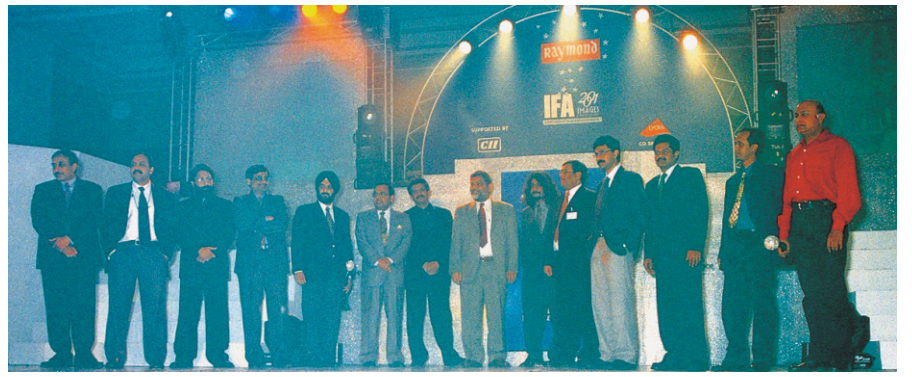
IFA 2001 awardees. Winners all!