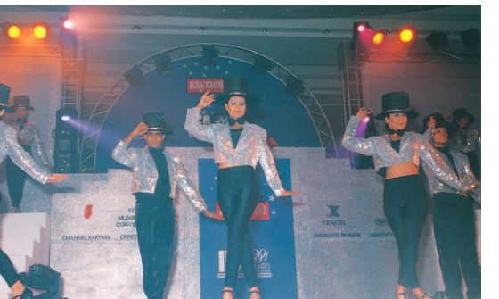
The welcome dance at IFA 2001